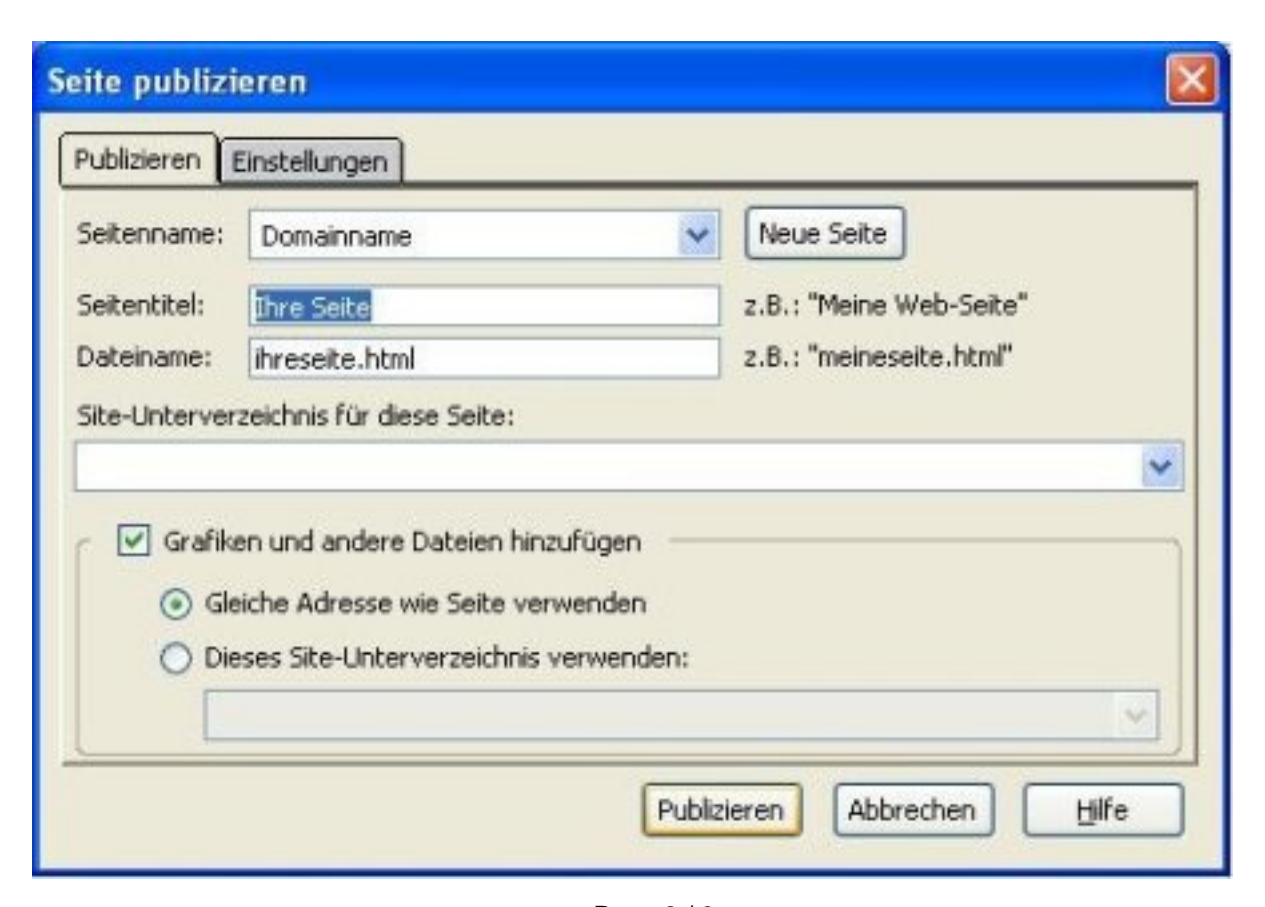
Page 2 / 3

Select your set "Site Name". Enter the page titel and the file name.